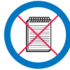
Book, notes, sketches or paper