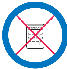
Calculator — except in specified subjects