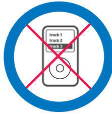
Electronic device such as MP3 player, iPod, tablet or smartwatch