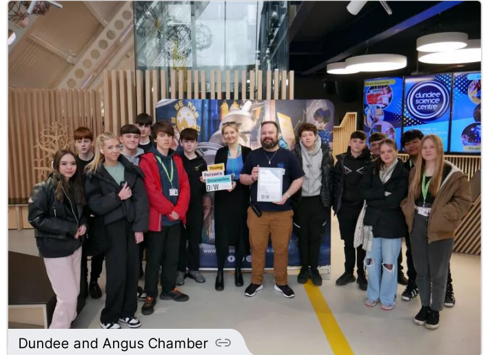
Dundee Pupils Discover the World of Work | Dundee and Angus Chamber