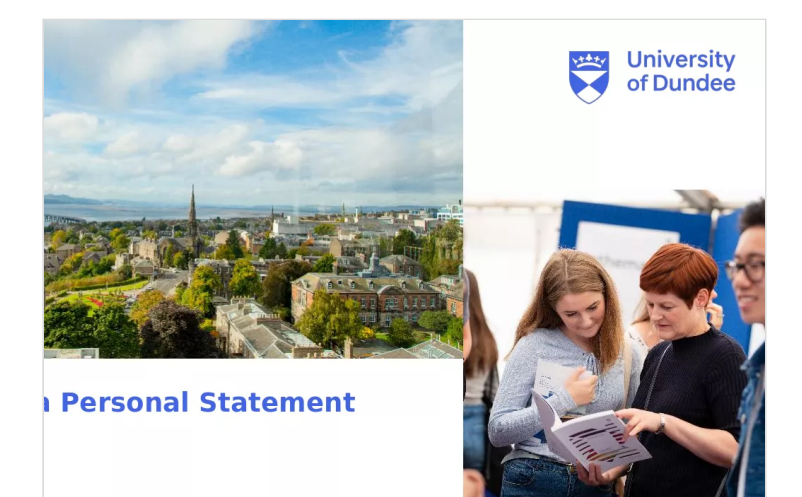
UCAS_Presentation.pptx Powerpoint presentation