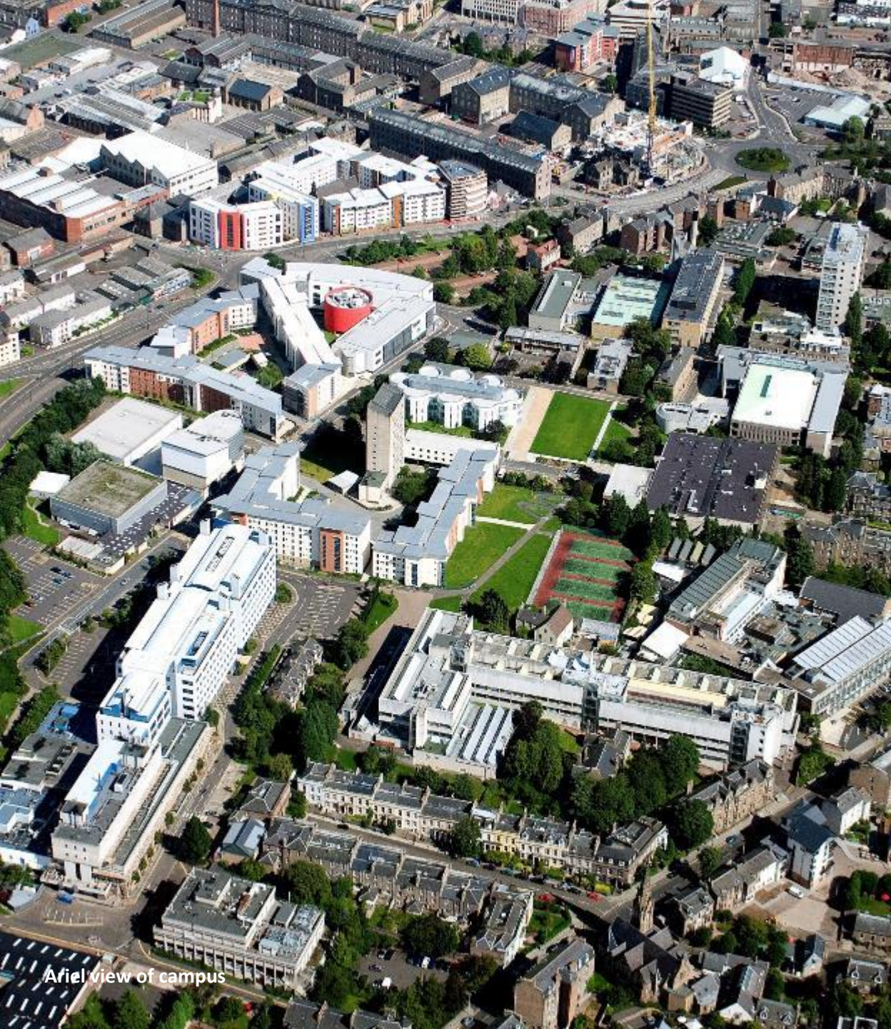
Aerial view of campus